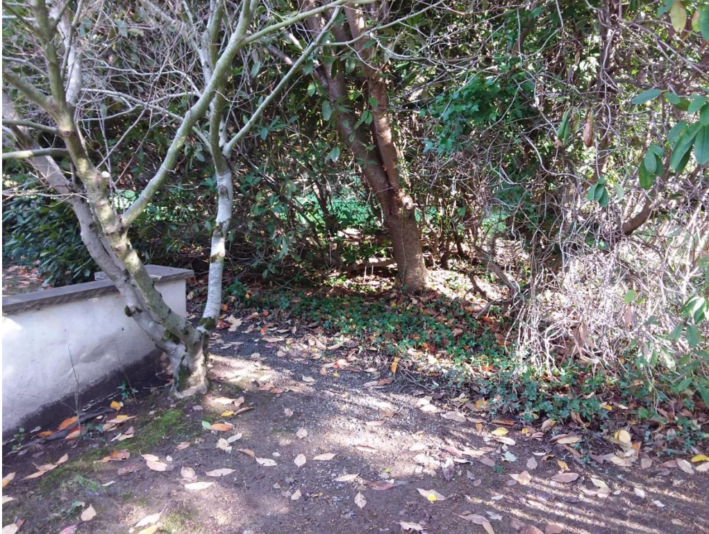
Figure 4. Looking ENE at the base of the #46 vine maple and the #45 cherry.